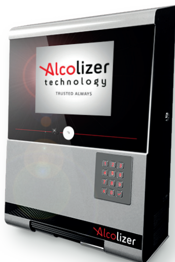
Alcolizer Wall Mount 4 with optional camera and key pad.