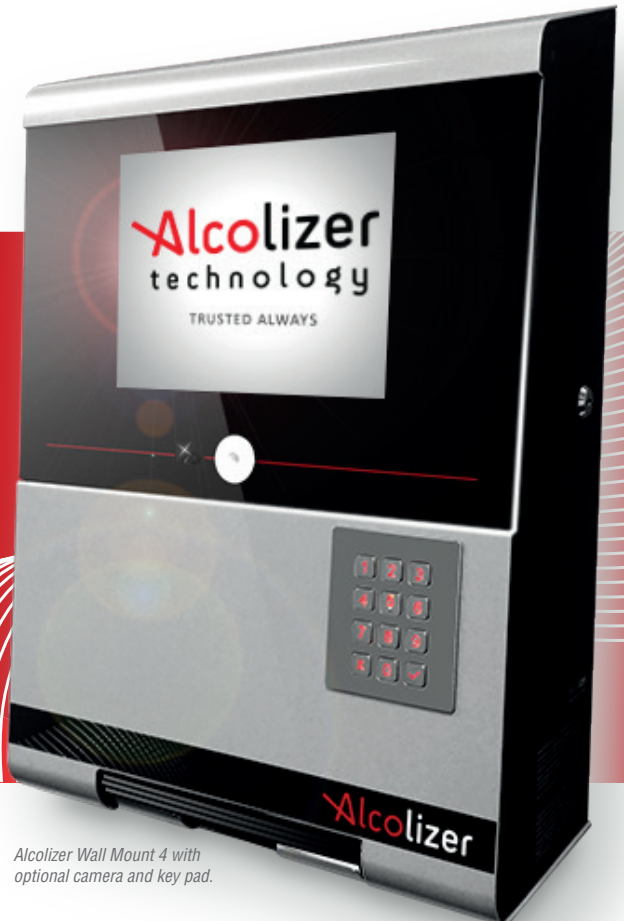
Alcolizer Wall Mount 4 with optional camera and keypad.

Our AlcoCARE™ program and our factory trained technicians can support your equipment either on-site or back-to-base – whichever is faster and most cost-effective for you.